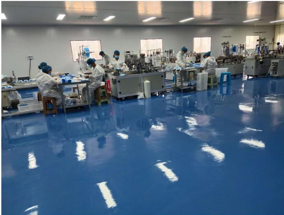
1) View for cleanroom